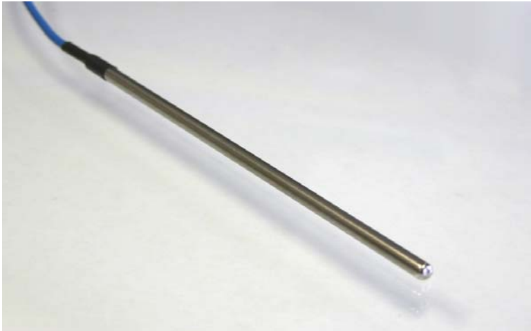
WLPI BASED FIBER OPTIC TEMPERATURE SENSOR FOR DEMANDING APPLICATIONS AND ROUGH HANDLING USAGE

Use with any of Opsens' WLPI series of signal conditioners